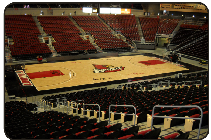
Louisville Cardinals- KFC YUM! Center