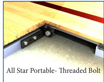
All Star Portable- Threaded Bolt