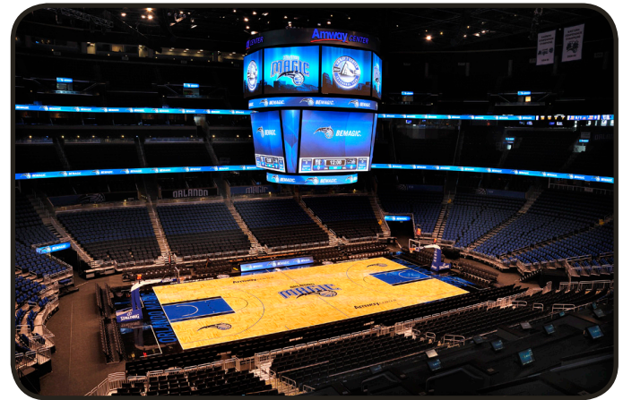
Orlando Magic- Amway Center